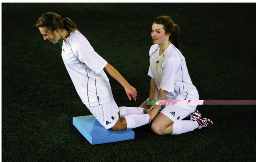
Fig 1 | Two examples of strength exercises. Top: side plank exercise. Bottom: the "Nordic hamstring lower"

Monica Orthopaedic and Sports Medicine Research Foundation, and the FIFA Medical Assessment and Research Centre, developed the warm-up programme. Before the start of the study one club tested the programme. It consisted of three parts (table 1). The initial part was running exercises at slow speed combined with active stretching and controlled contacts with a partner. The running course included six to ten pairs of cones (depending on the number of players) about five to six metres apart (length and width). The second part consisted of six different sets of exercises; these included strength (fig 1), balance, and jumping exercises, each with three levels of increasing difficulty. The final part was speed running combined with football specific movements with sudden changes in direction.