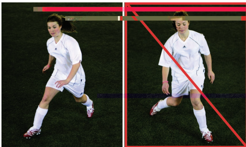
Fig 2 | Example of running exercise illustrating key objectives of all running, jumping, cutting, and landing exercises: core stability and correct lower extremity alignment. Left: correct technique; right: incorrect technique with pelvic tilt and knee valgus alignment to right

per club and a dropout rate of 15%, which means that we needed to include about 120 clubs with 2150 players.